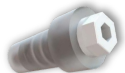
V-40 all plastic valve