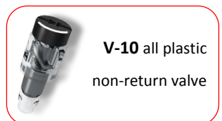
V-10 all plastic non-return valve