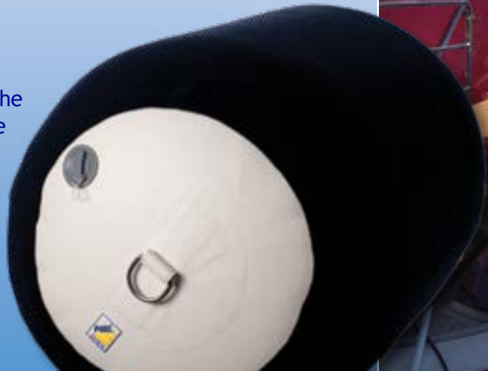
AERÉ Standard Inflatable Fenders (available in black, grey, navy & white)