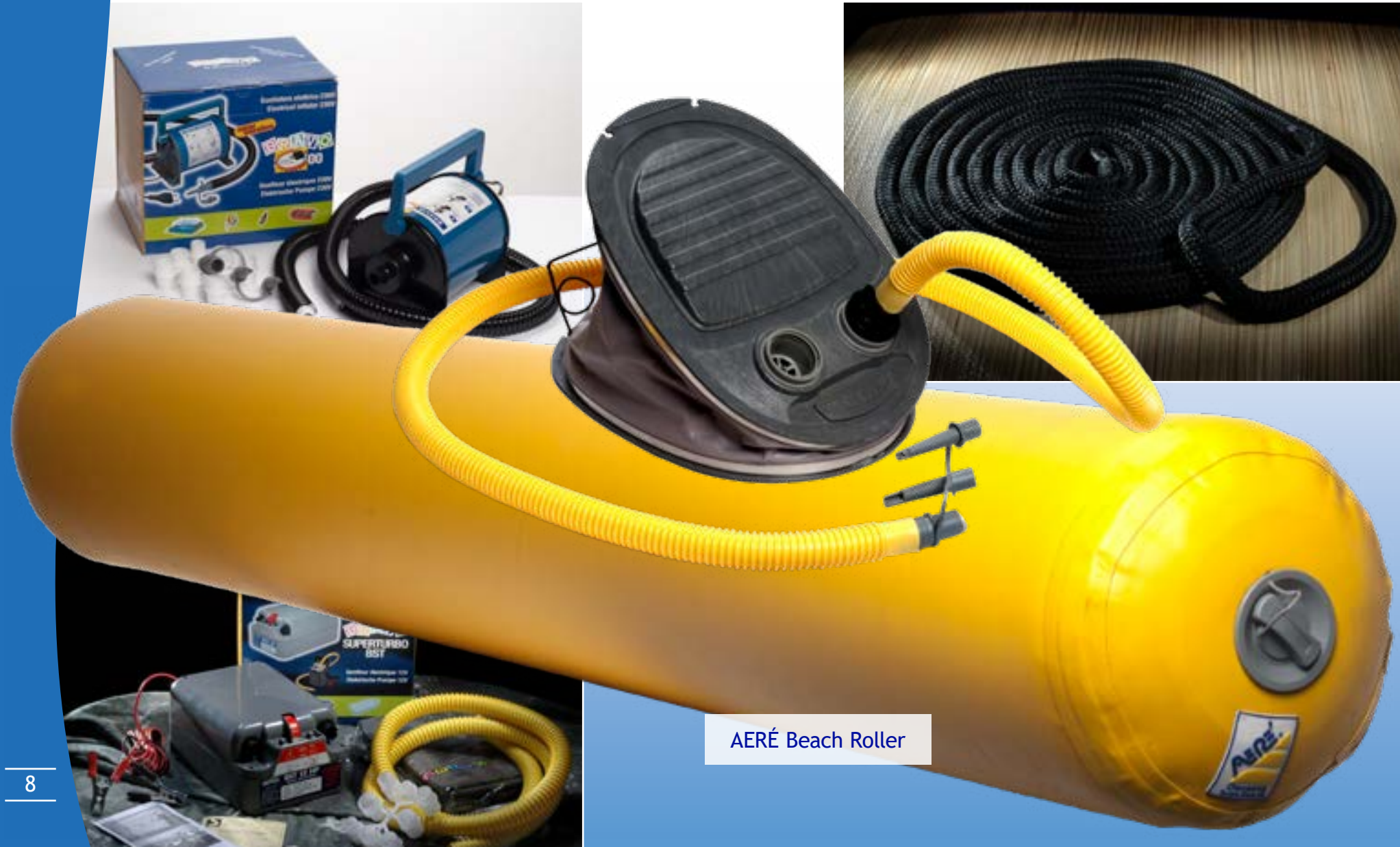
AERÉ Beach Roller

AERÉ Docking Solutions offers an extensive selection of accessories, inflators and lines to complete your docking requirements. Custom lines are also available.