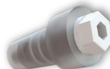
V-40 all plastic valve